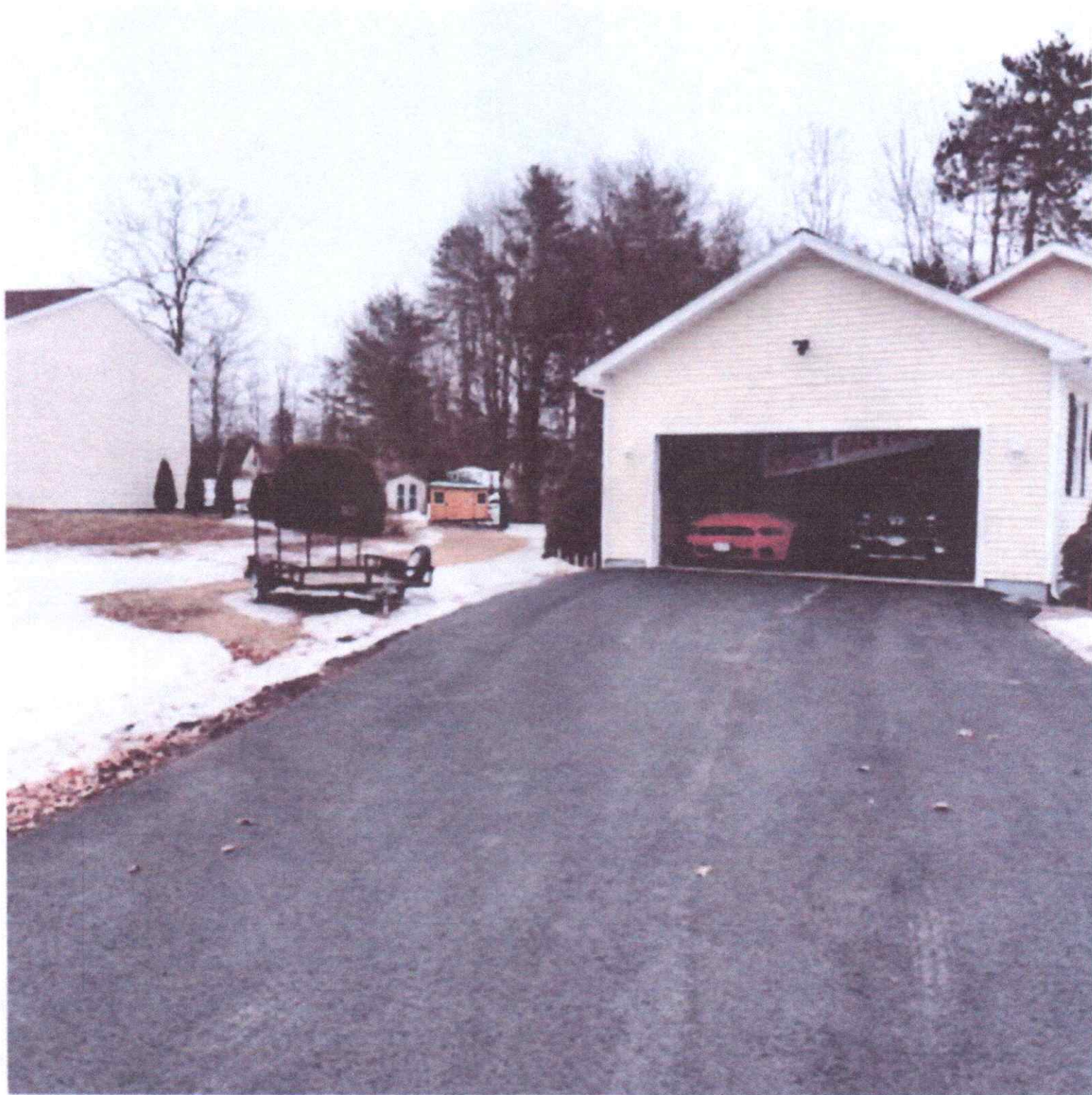
VIEW FROM ROAD AS PROPOSED