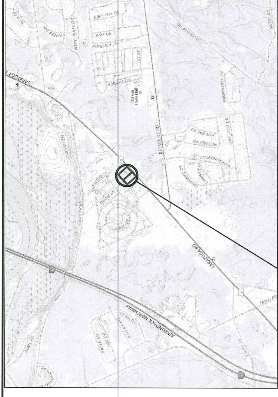
SITE LOCATION LOCATION MAP

Revision 1 - July 28, 2024 Revision 2 - August 27, 2024